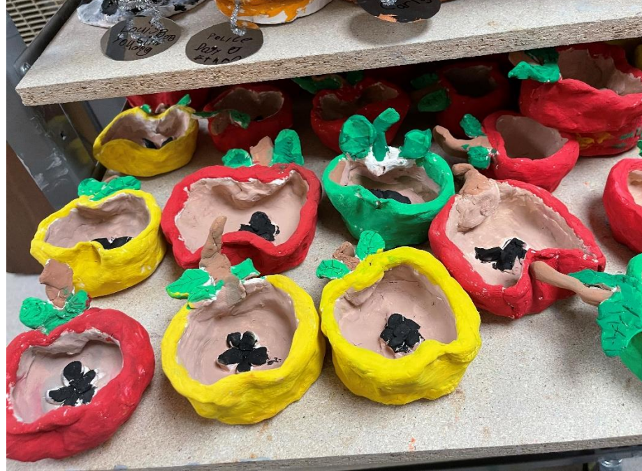
1<sup>st</sup> and 2<sup>nd</sup> grade students enjoyed painting their projects with tempera paint. These puppies and apples are too cute!