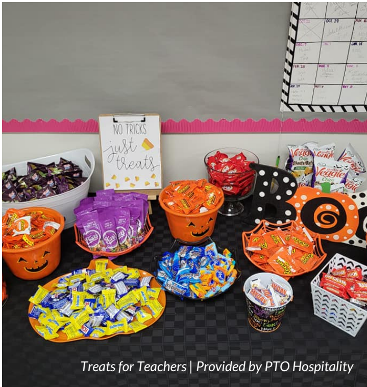
Treats for Teachers | Provided by PTO Hospitality