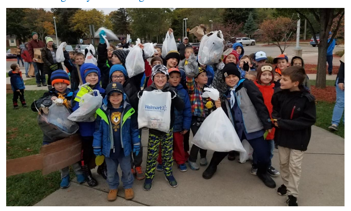
Thanks go out to our Adams Cub Scouts for cleaning up playground trash last Wednesday evening!

The Adams Lost & Found is located across from Room 21 in the 2<sup>nd</sup> grade hallway. Please check it regularly for missing items.